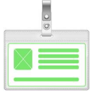
Card with straight corners